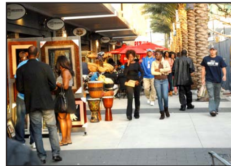
Patrons visit the vendors way businesses.

For more information on the Business Development Pathway, please visit www.cityoforlando.net/elected/parramore/business .