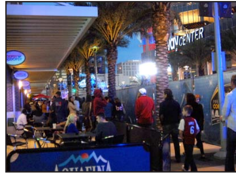
NBA All-Star Weekend fans visit neighboring businesses.

The free Downtown bus circulator, LYMMO, is planning to expand with two additional bus routes that will connect to the existing LYMMO route. One of the new routes, the East/West Expansion, will traverse Downtown along Central Avenue and Church Street, between Summerlin Avenue and Westmoreland Avenue. The second new route, the Parramore Expansion, will travel alongside I-4, connecting the new Creative Village redevelopment area with the Church Street District and Amway Center event hub. LYNX anticipates construction to begin in September 2012 and be completed and operational by the end of 2013, to coincide with the launch of SunRail. For more information on the LYMMO Expansion, please visit http://www.lymmostudy.com