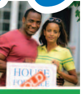
2012 FIRST EDITION