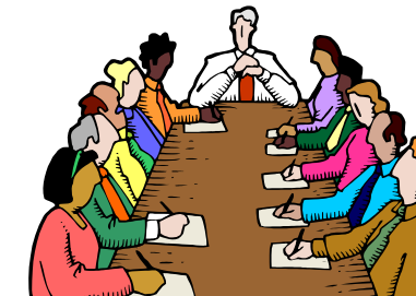
Community Foundation Board of Directors