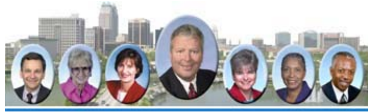
Mayor and City Council