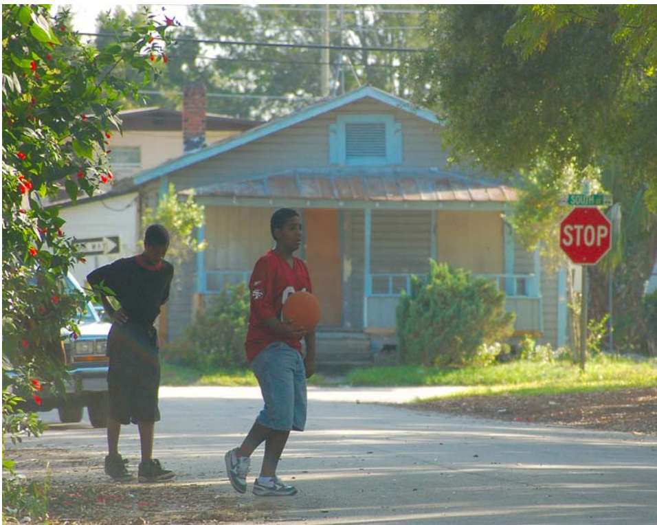
Parramore teenagers hanging out on a Sunday afternoon. Intersection of Lime Ave. and South Street, 11/6/05.

More programs are needed. Parramore parents have expressed concern about negative peer influences on teens and the struggle to find activities for them. Therefore, Parramore Kidz Zone will establish a prototype Youth Development Program in the neighborhood, modeled after the United Teen Equality Center (UTEC) in Lowell, MA. UTEC’s mission is to be a youth-led "by teens, for teens" safe-haven for youth ages 13-23. UTEC reaches out to young people through intensive street outreach