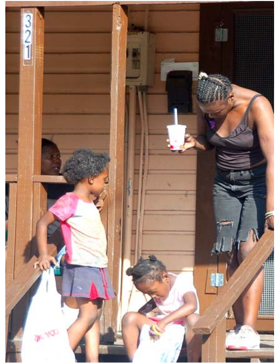
Sunday afternoon on the front porch, 321 S. Parramore Avenue, 11/6/05.

Every day in Parramore, children's health and educational needs are subordinated to more pressing survival needs of food, clothing and shelter. In neighborhoods where child health and education are luxuries, children are less healthy and less successful in school. The data for Parramore confirm this.