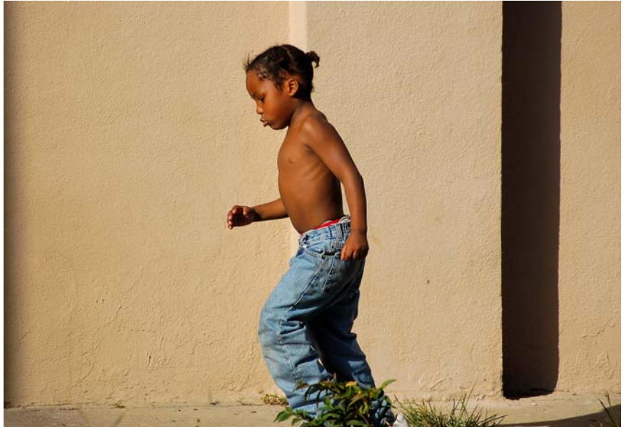
Little boy wandering along Central Boulevard on a Sunday afternoon. Parramore Heritage Neighborhood, 11/6/05.

Communities don't change completely in three short years. But three years is long enough for Parramore to reach the tipping point and, within the context of a comprehensive community redevelopment effort, long enough to "move the needle" on child well being. Orlando yearns for such a model. We are tired of investing in deep end services and anguished by the never ending flow of children