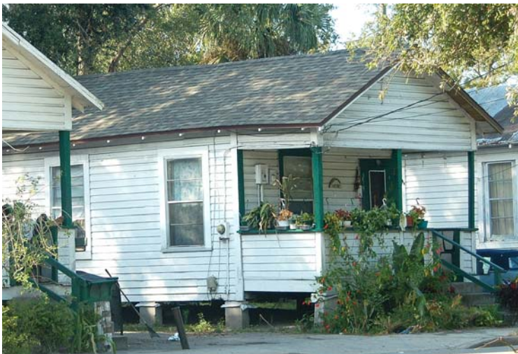
Typical clapboard housing from a bygone era, home to many families living in Parramore today. S. Lee Avenue, Parramore, 11//6/05.

1. A vulnerable population. Parramore is a 1.4 square mile neighborhood adjacent to the heart of Downtown Orlando. During segregation in the South, it was the center of the African-American community in Orlando. The population of Parramore peaked at 17,532 in 1960. The Civil Rights movement and subsequent opportunities provided by integration permitted middle class African-Americans to move out of the neighborhood. By the 2000 census, Parramore had declined to only 7,347 residents. While still overwhelmingly African-American (83%), a rapidly growing population of Haitian immigrants now comprise about 13% of the population. Parramore faced not only the loss of middle class African-Americans but also the placement of seven homeless shelters there, closure of the neighborhood's