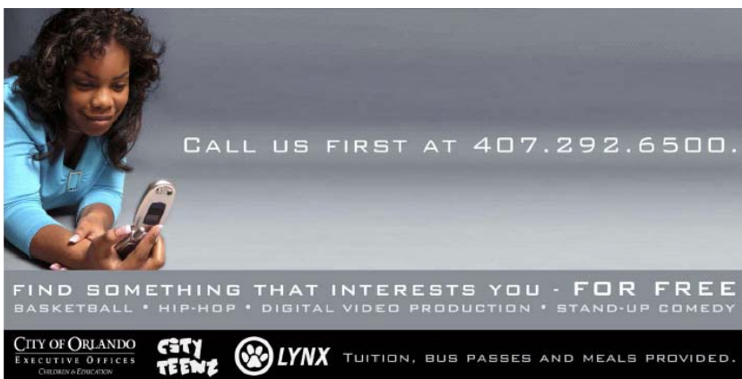
CityTeenz summer program guide disseminated throughout Parramore, Summer 2005.

These marketing strategies were tested by the City to enroll Parramore teenagers in programs this