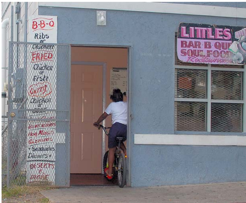
Little girl and her bike, hanging out at a neighborhood restaurant on a Sunday afternoon, S. Parramore Avenue, 11/6/05.

The above information will be obtained via a face-to-face survey in the Parramore neighborhood at project onset to establish baseline and again during project year three to determine whether these