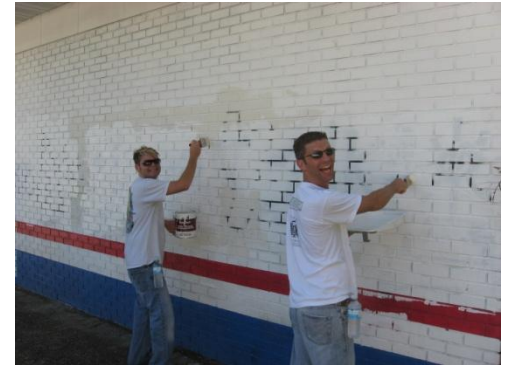
Wiping out graffiti in Orlando!